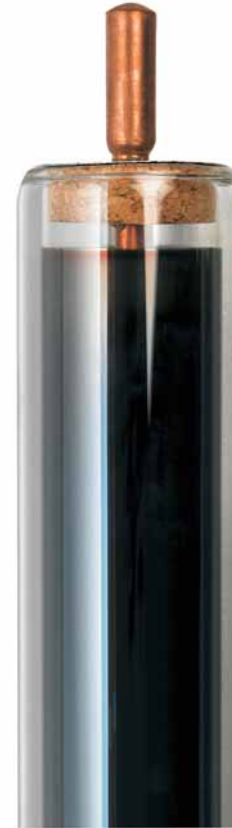
Heat Pipe in glass vacuum tube