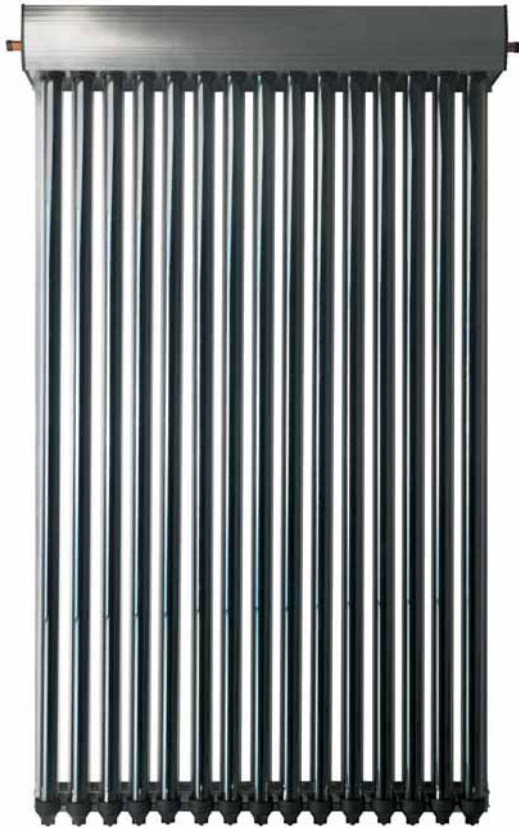
Teton - 15 Assembled with frame