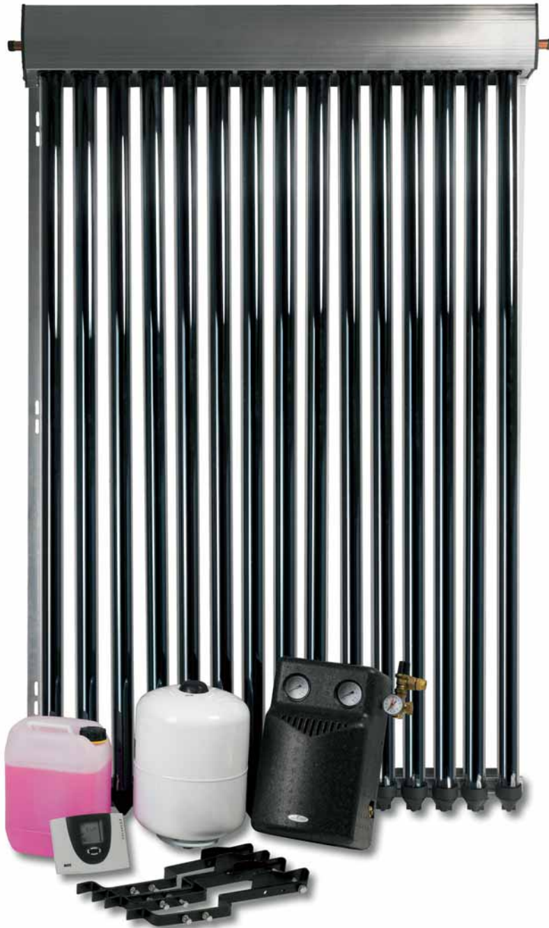
Teton -15 Easy to install, suitable for 3 bedroom properties.