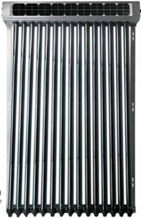
Atlas - 15 Assembled with frame