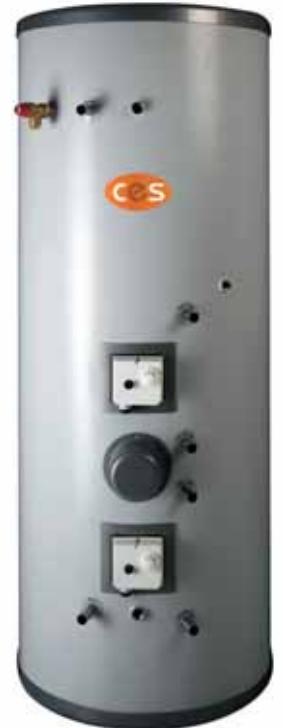
K2 Stainless steel twin coil cylinder