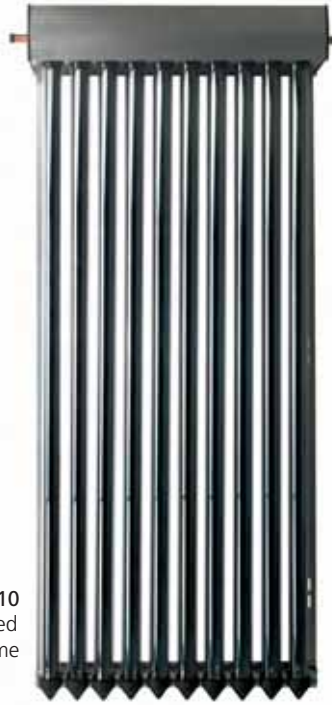
Teton - 10 Assembled with frame